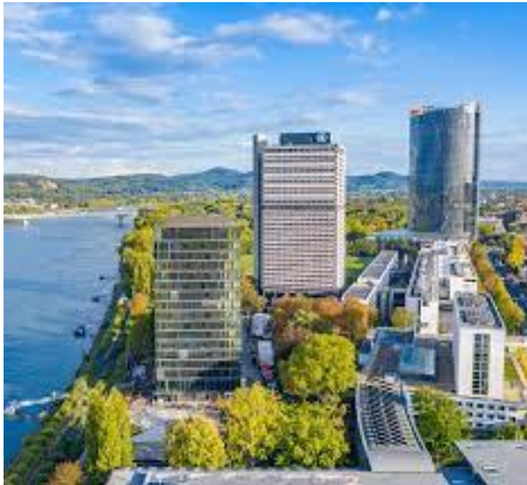
UN Campus – Climate Tower, Langer Eugen and AHH building Bonn, Germany

Direct train to Bonn Central Station: The Intercity (IC)/Eurocity (EC) train, also leaving from the Frankfurt long-distance train station, goes directly to Bonn Central Station. Travel time is between 1.5 and 2 hours. From Bonn Central Station, the UN Campus can be reached by bus or by subway (see directions below). A second-class ticket costs around 40 EUR. More information on Frankfurt airport .