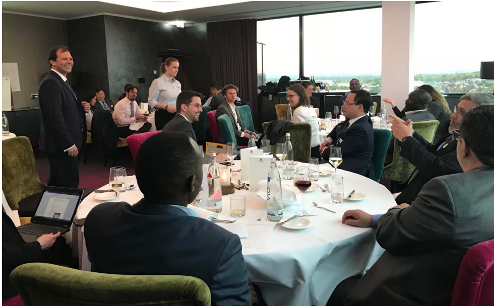
Knowledge Tools Workshop, May 2018 in Bonn