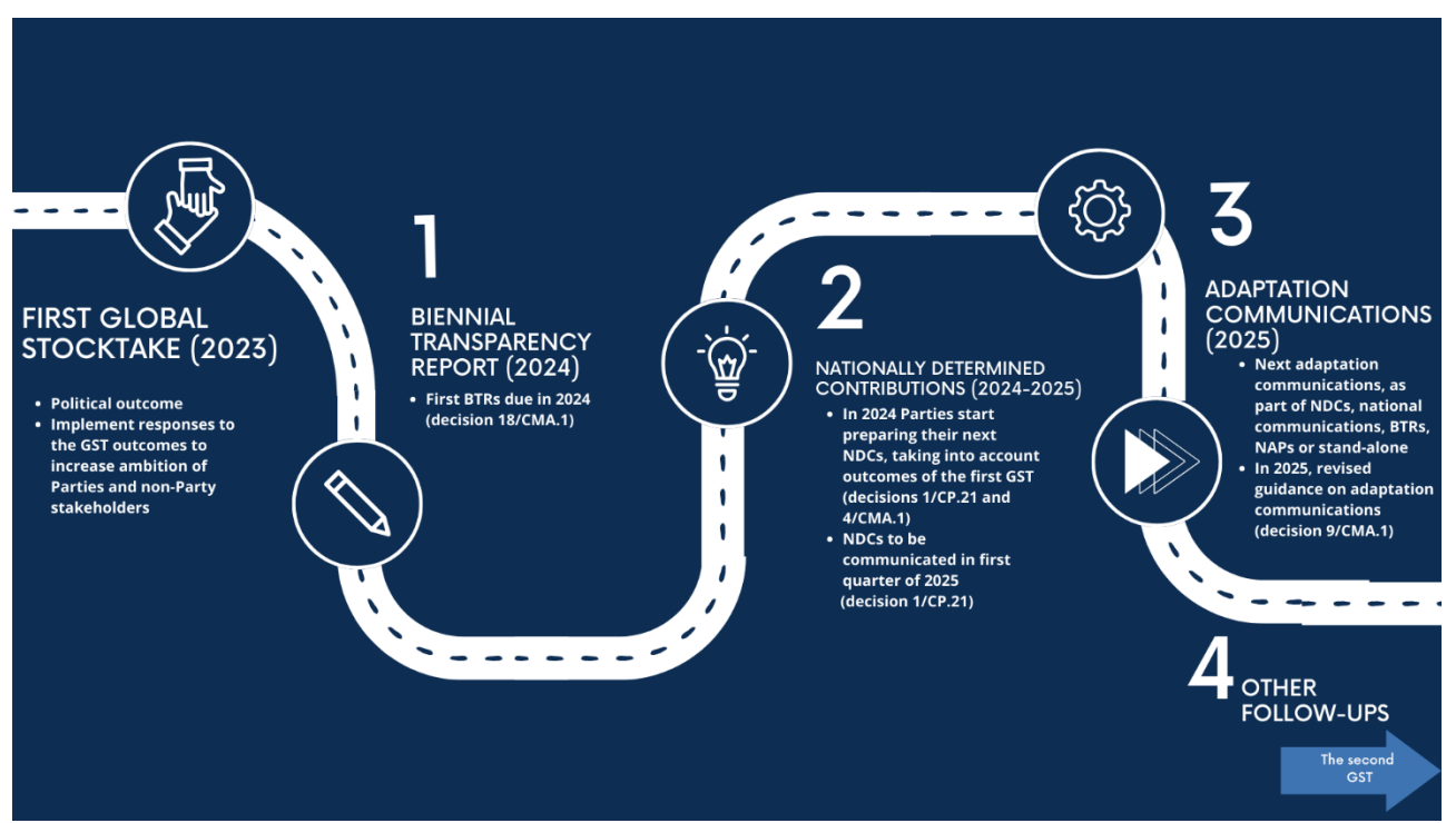
Figure 3 Follow-up activities to the first global stocktake

231. Under the CMA, other mandated activities of constituted bodies and under ongoing work programmes are relevant to matters identified through the TD, such as the Sharm el-Sheikh mitigation ambition and implementation work programme and the ad hoc work programme on the new collective quantified goal on climate finance, established for 2022–2024. In 2025, Parties will consider and potentially revise the guidance on adaptation communications. The GST outcomes and outputs (including this synthesis report) can inform these other processes.