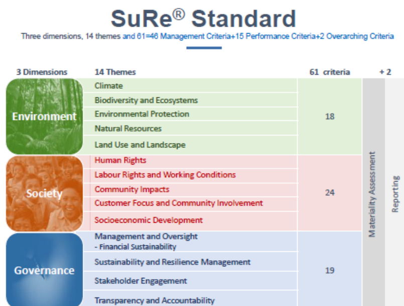
Figure 3 The SuRe ® standard