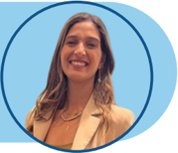
Omnia El Omrani, COP27 Presidency Climate Champion

Omnia El Omrani (COP27 Presidency Climate Champion) discussed the significance of youth leadership and participation in climate action.