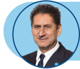
Francesco La Camera, IRENA