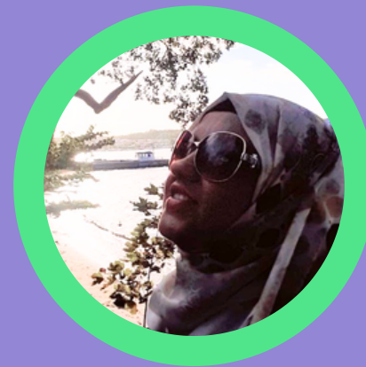
Inas Zayed X Pure Power, Egypt