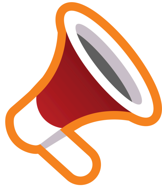
Call for Solutions