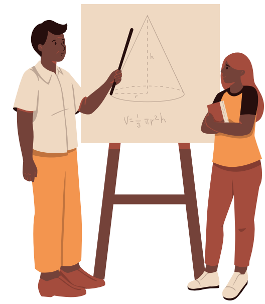
Y4C Learning offers