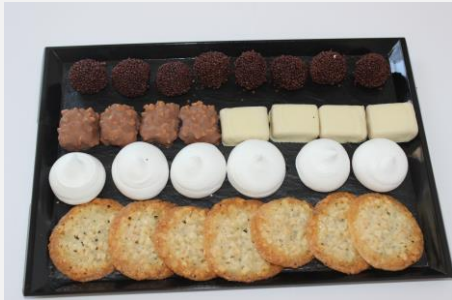
Mignardises (500 grs)