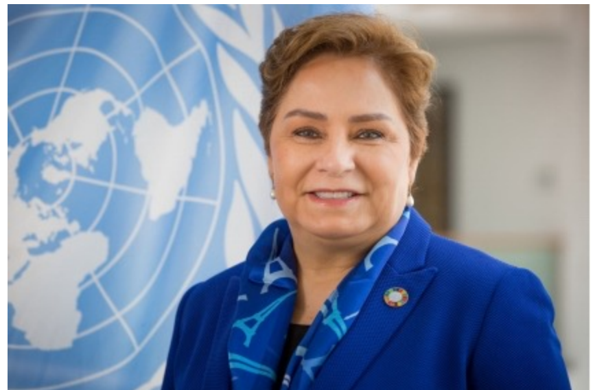
Patricia Espinosa Executive Secretary, UN Climate Change