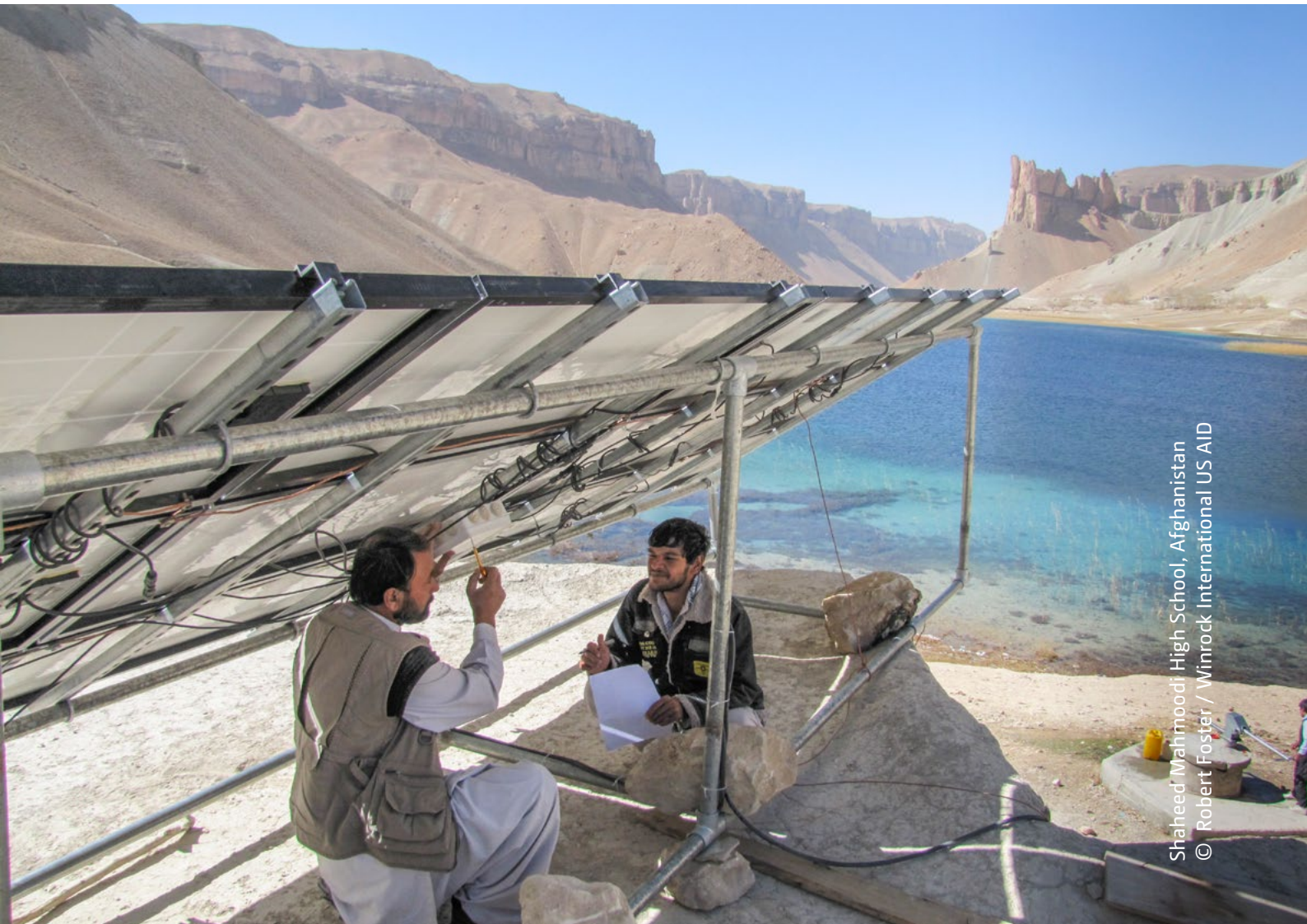
Shaheed Mahmoodi High School, Afghanistan