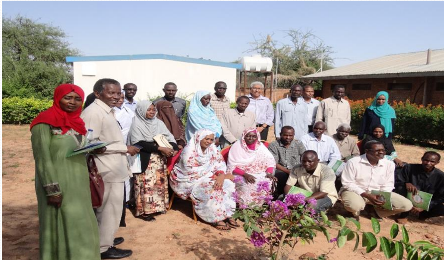
Consultative workshop on GAP, Elfasher, Darfur in 2019.