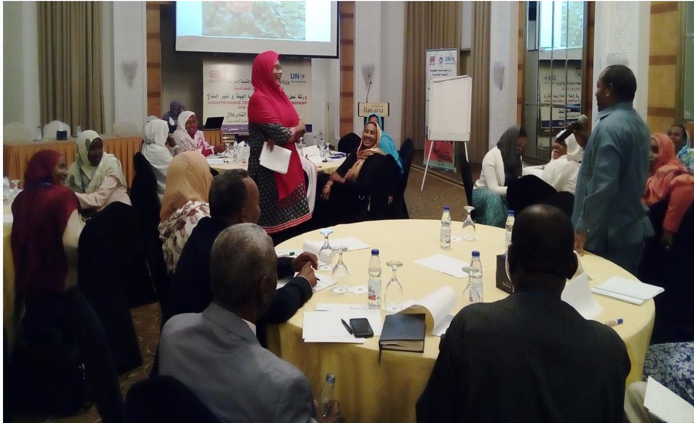
Gender and Climate Change workshop in 2017