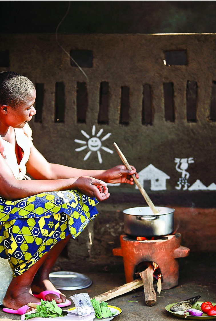
CDM ref 10182; Improved cookstove