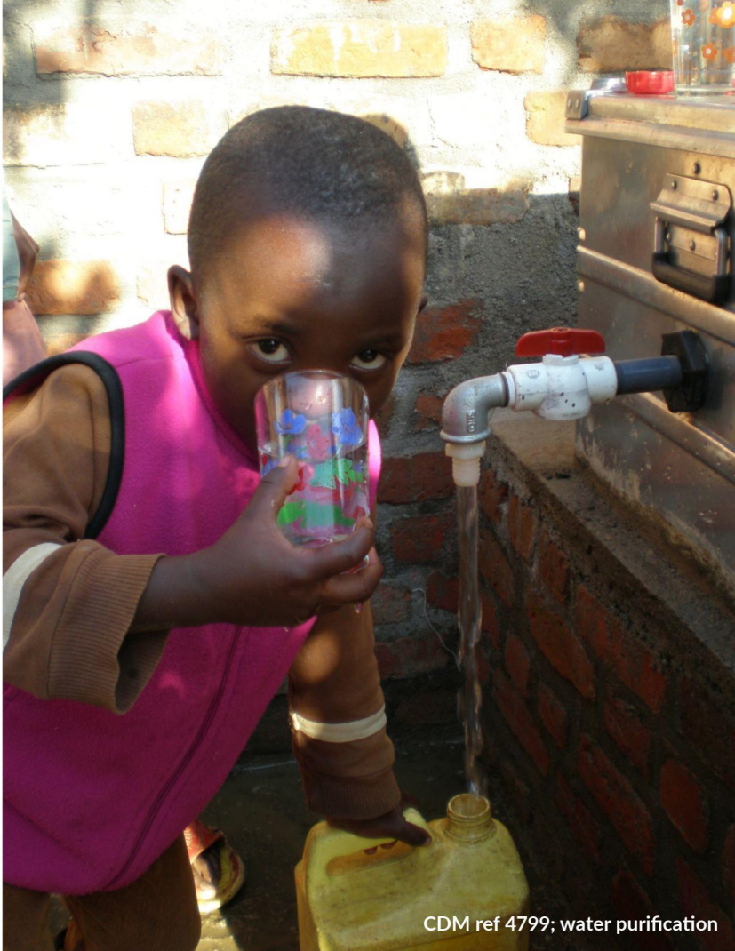
CDM ref 4799; water purification

RCC Kampala was set up in 2013 as a collaboration between United Nations Climate Change (UNFCCC) secretariat and the East African Development Bank (EADB) with a mandate to spread the opportunities and benefits of the Clean Development Mechanism (CDM) in Eastern, and Southern Africa. RCC Kampala has since 2015 broadened its scope together with other RCCs around the globe to serve as a regional presence of the UNFCCC by achieving other objectives of the United Nations Framework Convention on Climate Change, the Kyoto Protocol and the Paris Agreement. RCC Kampala operates in collaboration with regional partners to support national and regional climate action through, capacity-building, technical assistance, strategic networking, and sourcing know-how and resources to drive climate action and sustainable development. Our aim is to support the implementation of Countries' Nationally Determined Contributions (NDCs), the 2030 Agenda for Sustainable Development and other relevant policies in the region as well as helping to channel resources and climate finance towards climate action.