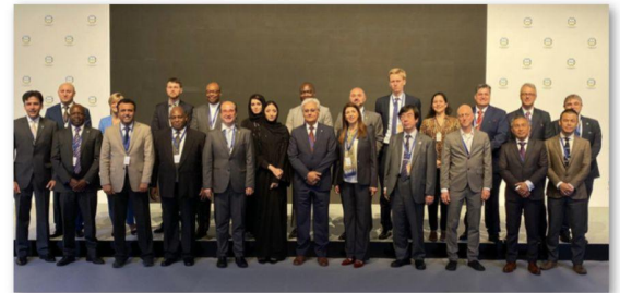
Participants of the 5th RCC Global Forum held in Dubai, UAE

The annual RCC Global Forum meeting was held on 20-21 October in Dubai concurrent with the World Green Economy Summit 11 . The RCC Global Forum saw the official launch of the newest entrant to the RCC network, RCC Dubai. The Global Forum was attended by representatives of the host partners of the RCCs. Also joining the Forum were representatives from RCC collaborating organizations, such as UN Environment, UN Economic and Social Commission for Asia Pacific, UN Economic and Social Commission for Western Asia, Germany's GIZ, among others. In addition to the continuous support to the CDM, partners proposed other areas of RCC work in 2020.