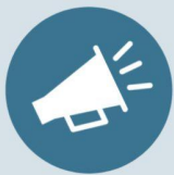
Communication and Outreach