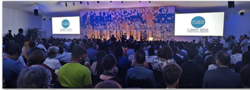
Opening of the Latin America and Caribbean Climate Week 2019

The RCCs supported CDM-related events during the regional climate weeks in Africa, Asia-Pacific and Latin America and the Caribbean 10 . In the Africa and Asia-Pacific regions, the events highlighted experience and opportunities offered by standardized baselines to replicate replicate mitigation projects. In Latin America and the Caribbean, the event focused on the role of market mechanisms like the CDM in developing carbon pricing strategies and reviewed the status of carbon pricing. The RCCs also supported the regional NDC dialogues taking place at the margins of regional climate weeks.