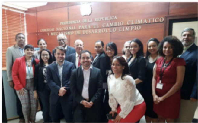
The launch of CI-ACA in Dominican Republic – July 2018; CI-ACA concluded the first phase of its implementation in June 2019, described in a synthesis report on lessons learned and achievements