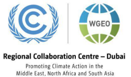
Regional Collaboration Centre – Dubai Promoting Climate Action in the Middle East, North Africa and South Asia

Partnership with the World Green Economy Organization (WGEO) to establish RCC Dubai 13 which will cover countries in the Middle East, North Africa and South Asia, and placement of a Green Economy Expert at each RCC. RCCs supported the organization of five WGEO regional ministerial conferences on green economy around the globe, and convened a special session on climate finance at each conference.