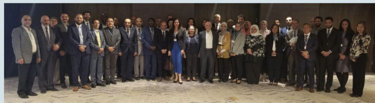
Inception Workshop, Arab Climate Finance Mobilization and Access Strategy, Cairo, Egypt

The RCCs are supporting implementation of the Needs-based Finance Project (NBF) 8 in 10 regions and sub-regions, covering 92 countries. In 2019, the RCCs supported the project's launch in: the Arab States, Eastern Caribbean States, Small Island Developing States in the Indian Ocean, Southern Africa and Southeast Asia. See the video on NBF in the MENA region 9 . Specific events supported by RCCs in 2019 included: