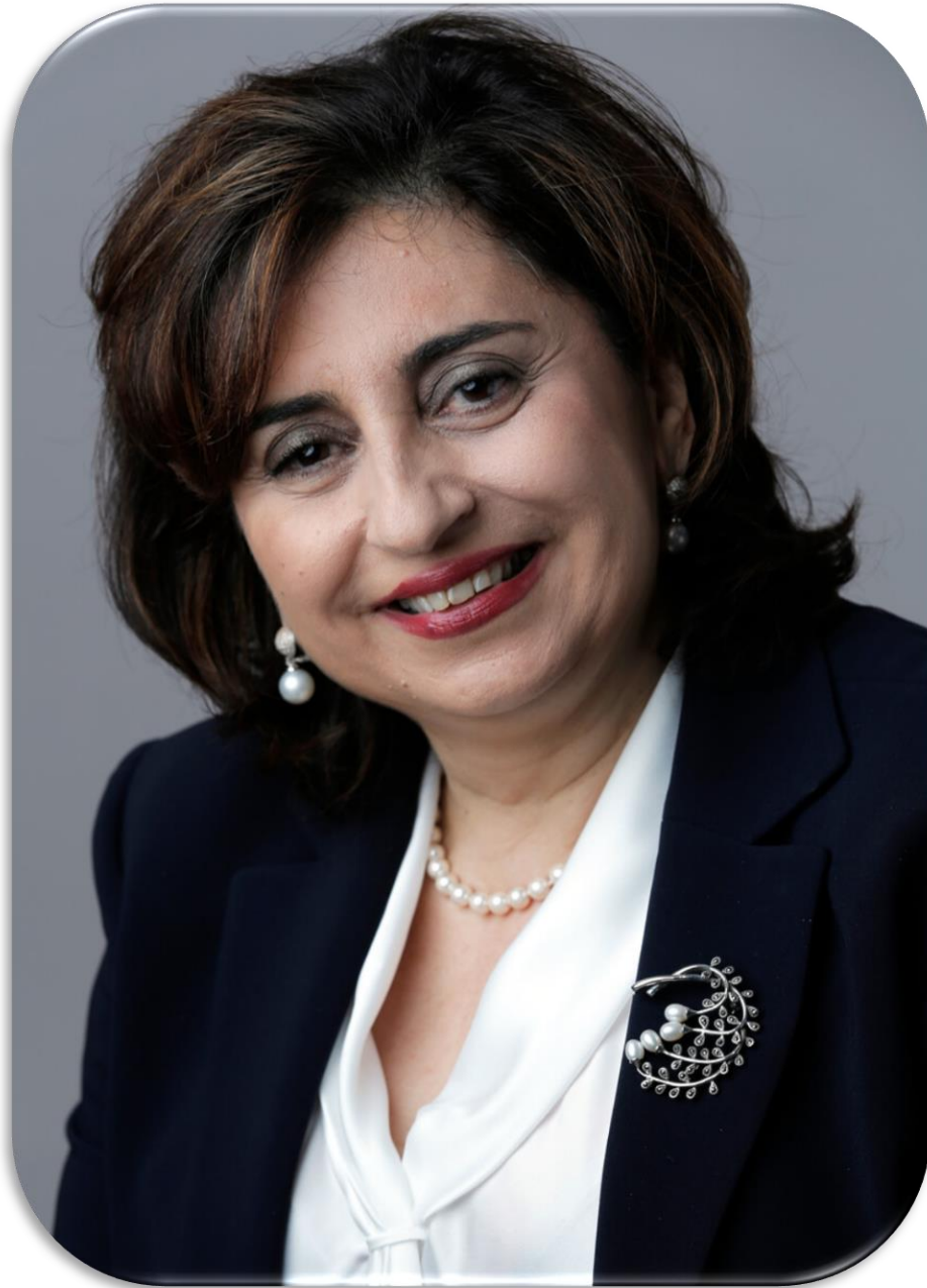
Sima Bahous Executive Director UN Women