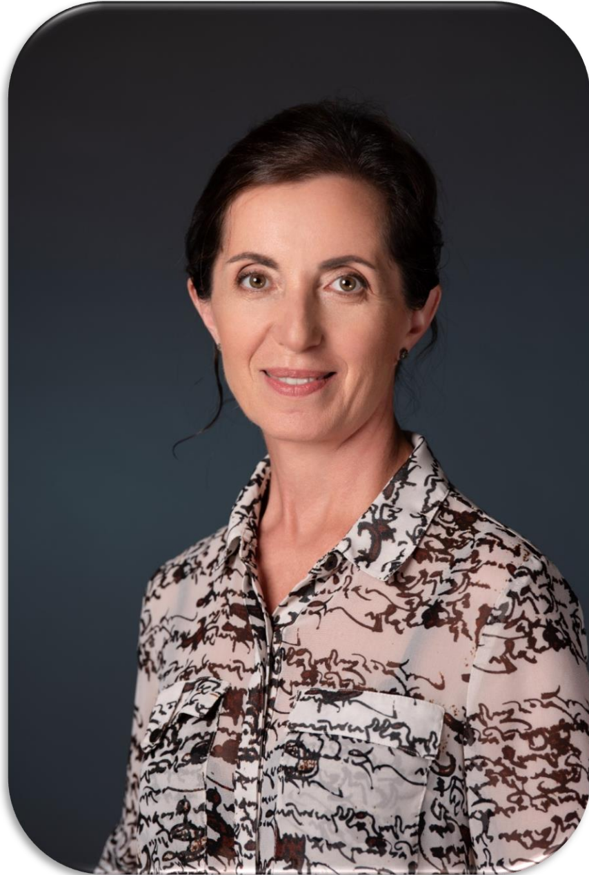
Ina Parvanova UN Climate Change