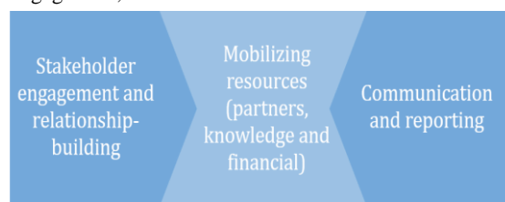
Figure 1 – Relationship between stakeholder engagement, communications and resource mobilization

12. In addition, some 20 members of the PCCB Network have used their own media channels to promote activities of the Network and boost the reach of capacity-building-related updates and information, bringing them to a wider audience.