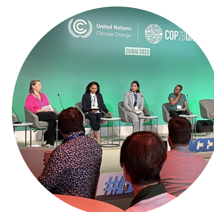
ACE joint event at COP28 with Under2 Coalition