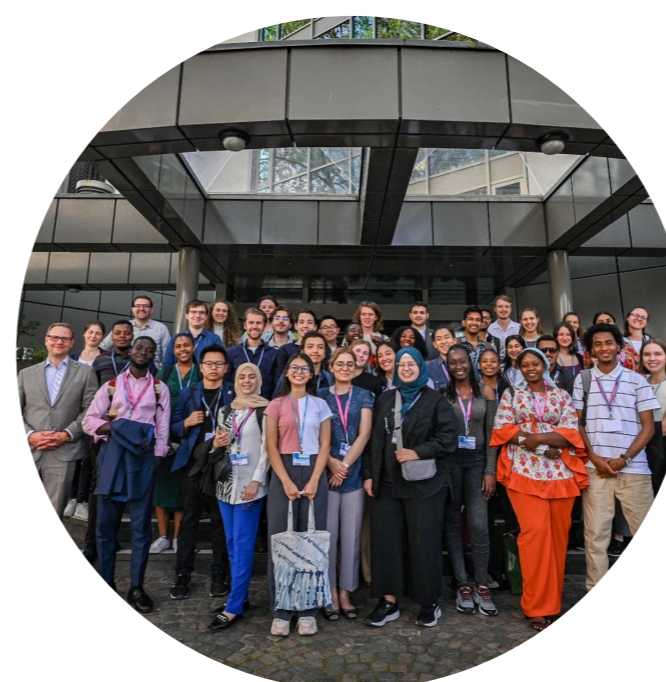
ACE Youth Event

Events in 2022-2024: ACE Youth Event, ACE Focal Points Academy, Regional workshops for Focal Points, UNESCO-UNFCCC Webinar Series, etc.