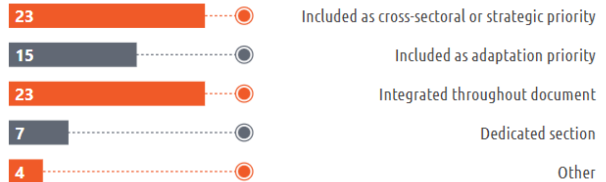
Context for reference(s) to capacity development (# of NAPs)