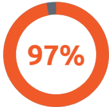
# of NAPs that mention capacity development