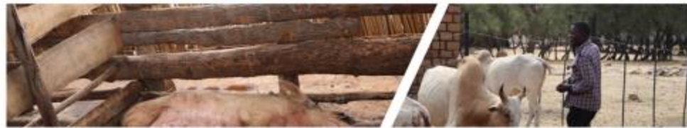
Livestock Keeping Project; Top Right: Sheep Farming Project in Tanzania; Top Left: Goat farming project in Burundi; Bottom Right: Pig Farming project in Rwanda; and Bottom Left: Cattle fattening project in Tanzania.