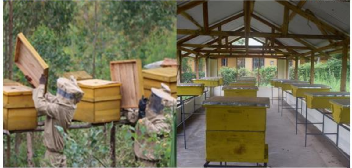
Bee keeping Activities; Right: Forest bee keeping in Burundi; Left: Bee keeping in Bee house in Kenya.