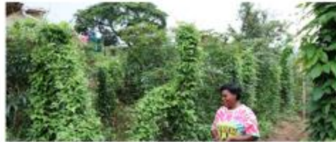
Climate Smart Agriculture; top right Soya Bean Farming in Kenya; Top Left Tomato farming in Tanzania; Bottom Right Maize farming in Rwanda; and Bottom Left Improved Pasture production in Uganda.