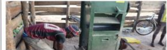
Off-farm activities; Top Right: Tailoring project in Rwanda; Top Left: Tailoring project in Tanzania; Bottom Right: Barber and hairdressing project in Rwanda; and Bottom Left: Agro-processing project in Burundi.