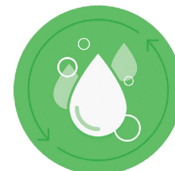
Responsible Water Utilization