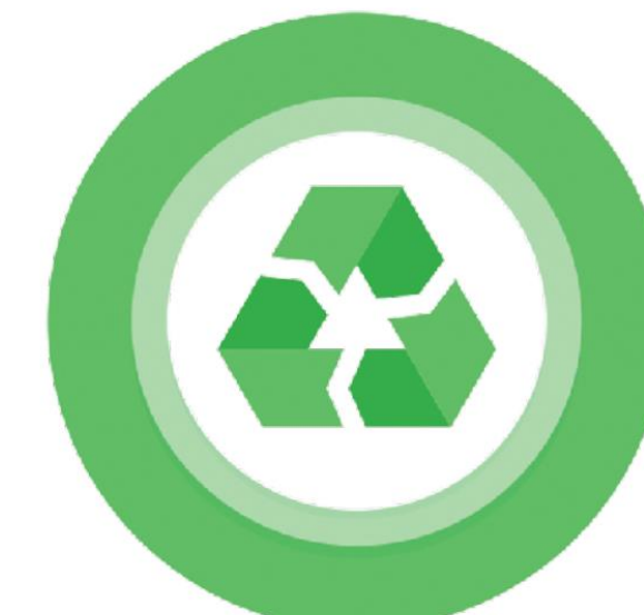
Ecological Solid Waste Management