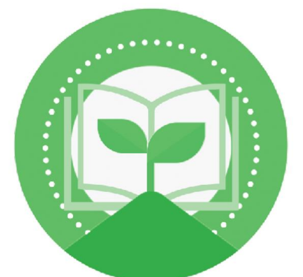
Greening Institutional Management Systems, Divest-Invest, & Campus as a Natural Environment