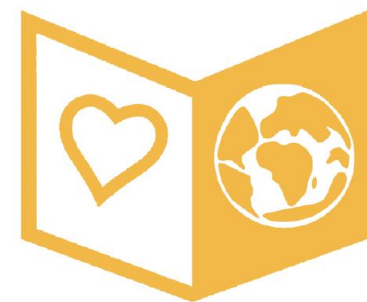
LAUDATO SI' GOALS