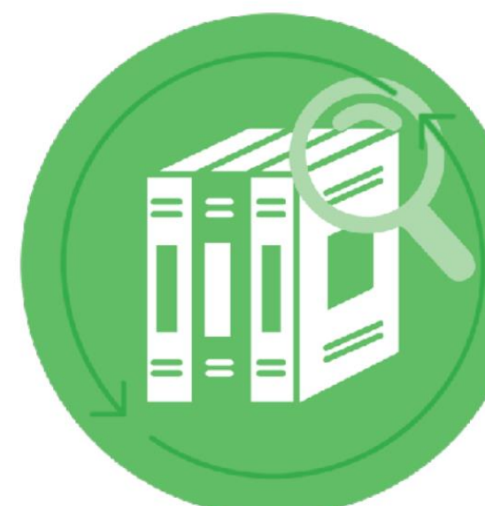
Integrated Ecological Curriculum & Environmental Sustainability Research