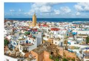
Regional Hub Rabat, Morocco