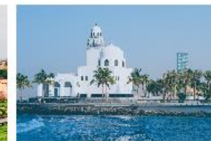
Regional Hub HQ Operations, GCC & Yemen