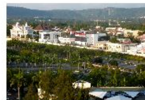
Regional Hub Abuja, Nigeria