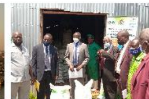
Regional Hub Kampala, Uganda