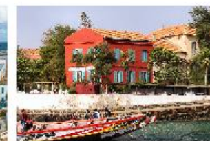
Regional Hub Senegal