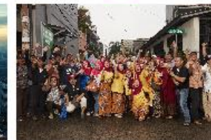
Regional Hub Indonesia