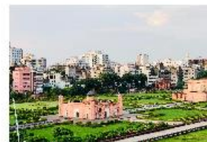
Regional Hub Dhaka, Bangladesh