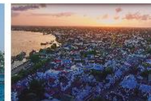
Regional Hub Paramaribo