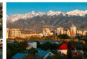
Regional Hub Almaty, Kazakhstan