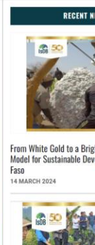
From White Gold to a Bright Model for Sustainable Devt Faso 14 MARCH 2024