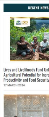
Lives and Livelihoods Fund Unlocks Agricultural Potential for Increased Productivity and Food Security 17 MARCH 2024