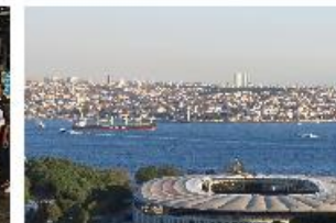
Regional Hub Türkiye