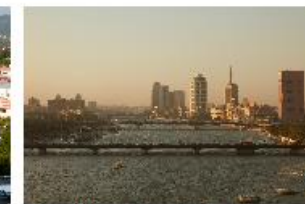
Regional Hub Cairo, Egypt