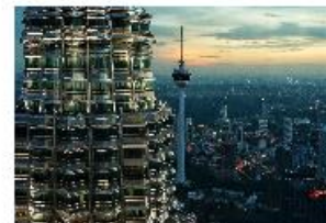
Center of Excellence - Kuala Lumpur, Malaysia