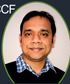
Alope Barnwal Africa, Cities