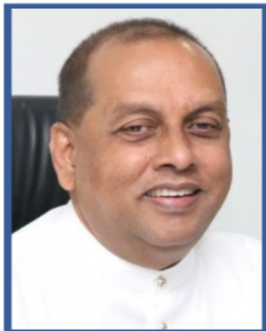
Hon. Mahinda Amaraweera Minister of Environment of Sri Lanka