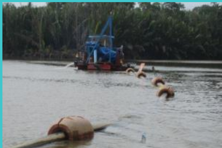
Widening and deepening of major rivers