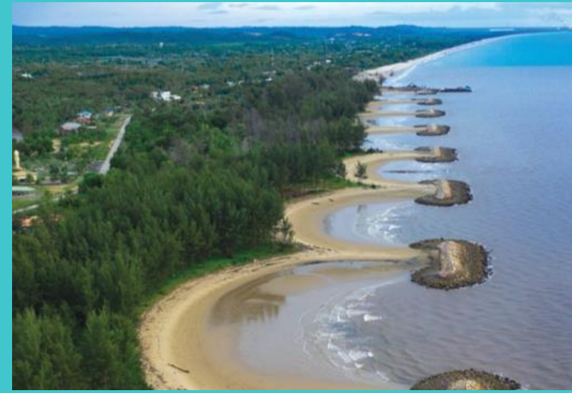
Danau Beach, Tutong