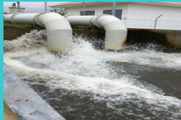
Drainage pump infrastructure to improve river flow.