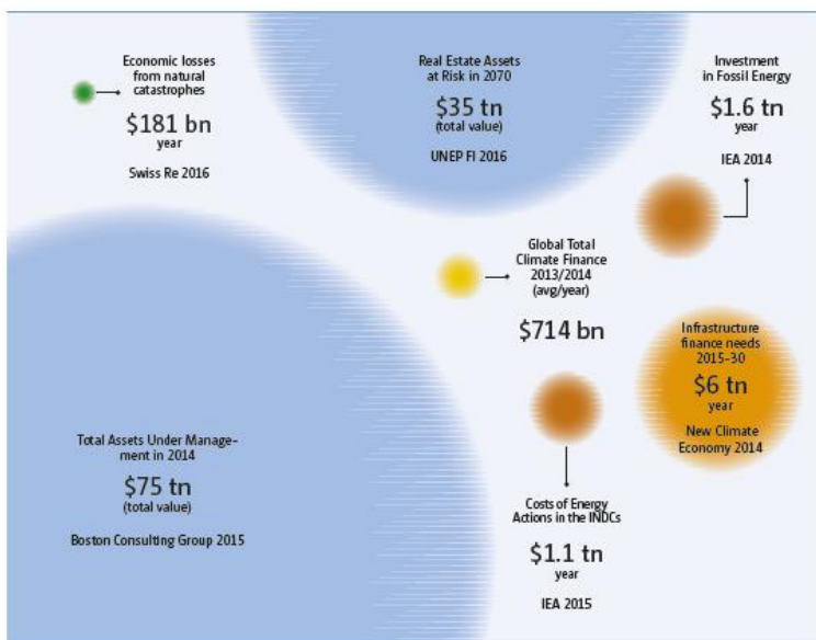
Figure 3 Global climate finance in context

Note: This figure seeks to put the total volume of global finance flows in the context of wider trends in global investment. The flows featured on this diagram are not strictly comparable, and are presented for illustrative purposes only. Full details of the underlying studies are included in chapter 3 of the 2016 biennial assessment and overview of climate finance flows.