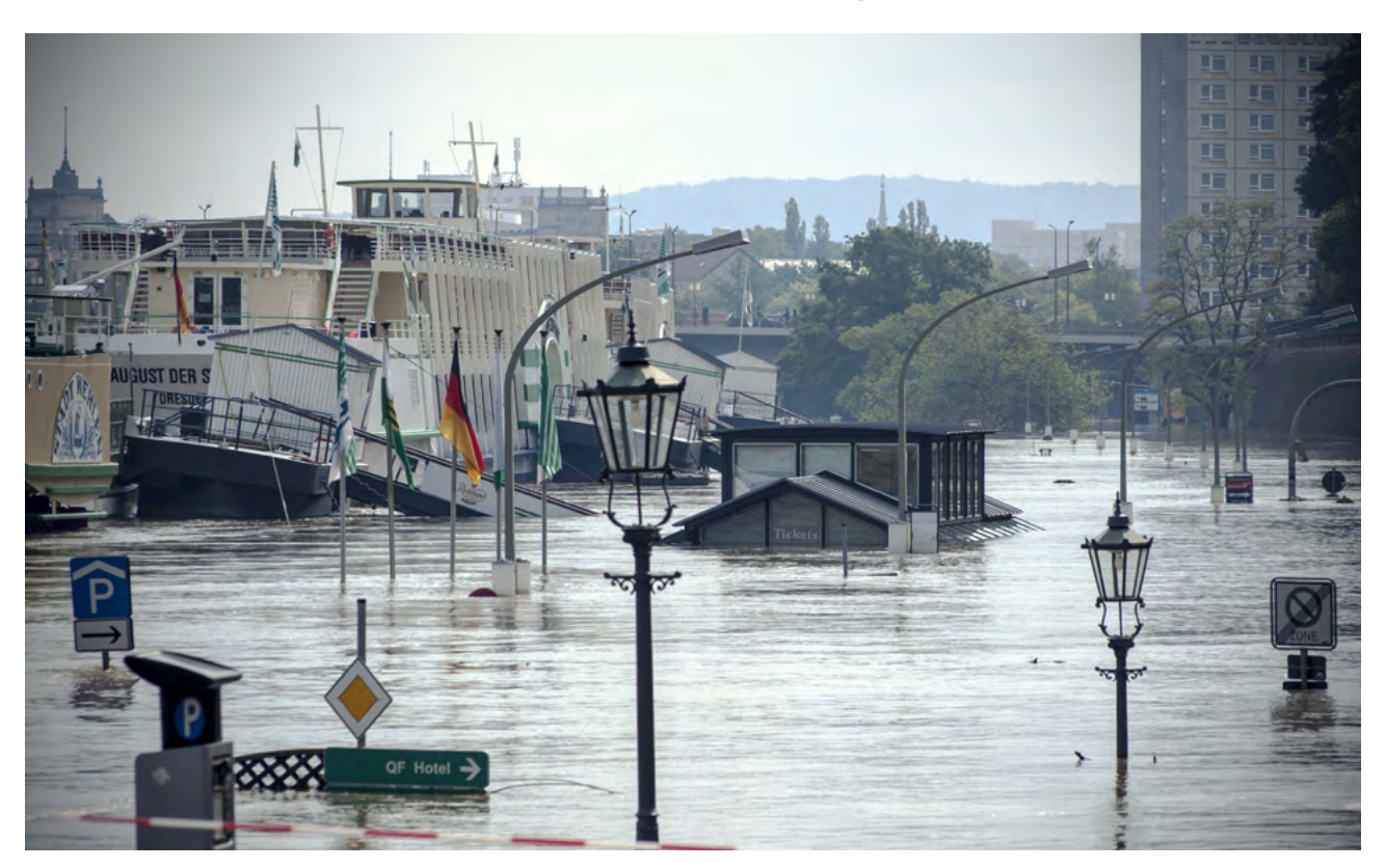
Flood in Germany, Dresden city

P&C (also known as non-life or general) re/insurance companies provide protection against the financial risks that various adverse events may have on the assets of a customer (e.g. households, businesses). The risks covered