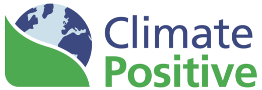
School of Design and Environment - SDE4 Singapore Educational buildings