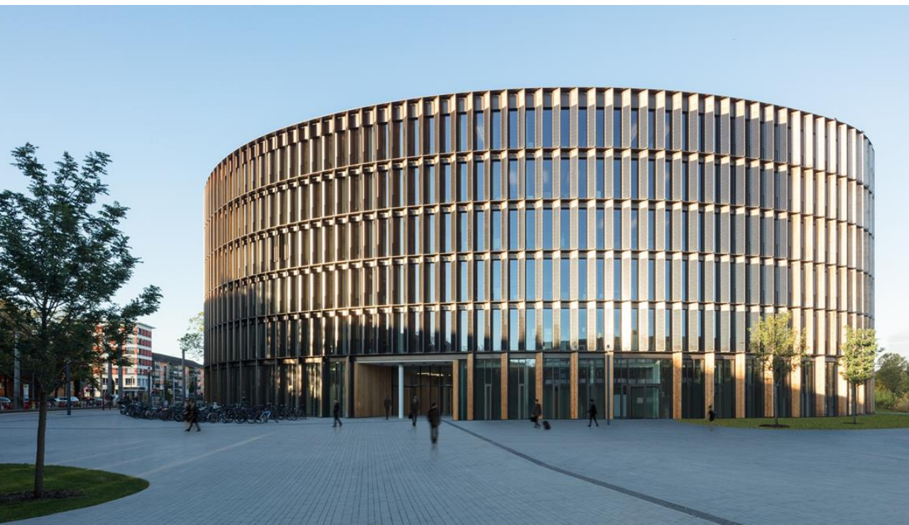
Freiburg City Hall Freiburg Offices