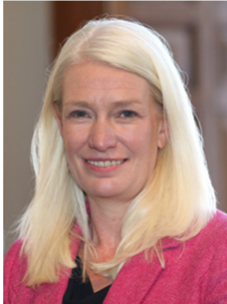
The Rt Hon Amanda Milling MP Minister for Asia

Foreign, Commonwealth & Development Office (FCDO) United Kingdom