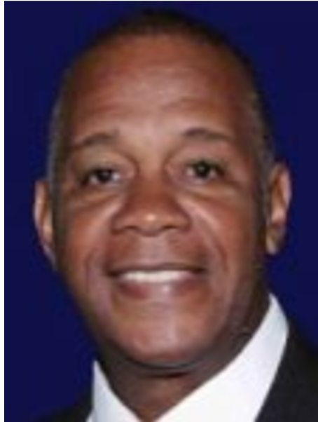
Hon Eric Evelyn

Minister of Environment and Cooperatives