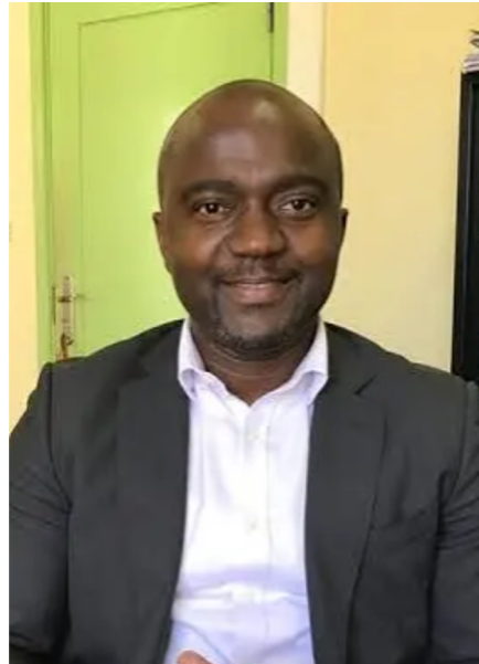
Hon Minister Osvaldo Abreu Minister for Infrastructure and Natural Resources