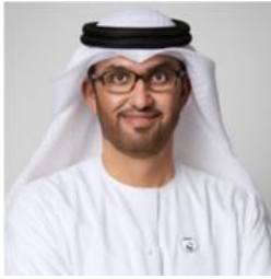
H.E. Dr. Sultan Ahmed Al Jaber The United Arab Emirates (Asia-Pacific)