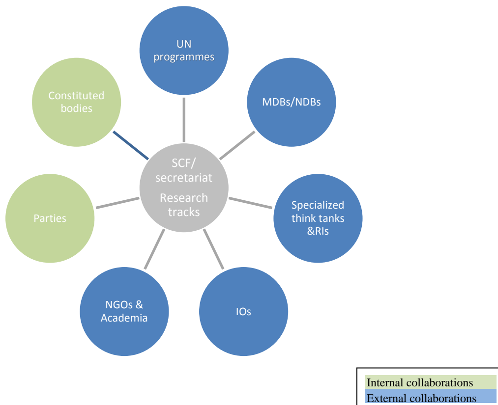
Figure 1: Hub-and-spokes approach

6. The technical work also aims to enhance engagement with Parties, the operating entities of the Financial Mechanism, the subsidiary and constituted bodies, multilateral and bilateral channels, and observer organizations, including those that produce aggregate data and information on needs. For example, in addition to Parties, the SCF can closely engage with a wide variety of institutions that produce and aggregate information on needs at the global and regional levels, including on issues relating to methodologies and approaches for determining needs. Such institutions include the UN agencies, constituted bodies under the Convention, multilateral development banks, bilateral development finance institutions, international organizations, research institutions and think tanks, private sector financial institutions, academia, and civil society organizations that operate in developing countries. It can do so, among others, by participating in the meetings of the SCF, dedicated technical meetings and other outreach channels the SCF wishes to establish such as webinars. The engagement with Parties and data producers and aggregators allows the SCF to produce a robust report.