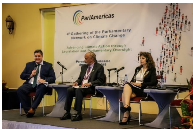
Session 3: Overcoming the Obstacles and Seizing Opportunities for Implementing Carbon Market and Non-Market Mechanisms