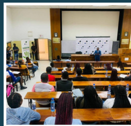
CAPACITY BUILDING & TRAINING