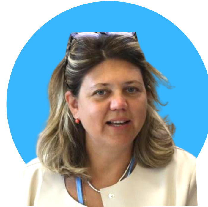
Roberta Ianna Ministry of Ecological Transition, Italy