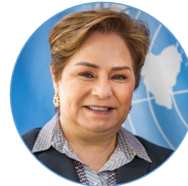
Patricia Espinosa Executive Secretary, UN Climate Change

She has served as a director and CEO of various companies. Prior to her appointment as minister, she was the General Media Manager for the Copesa group, and director of the Santiago Municipal Theater, advisor at the Center for Public Policy of the Pontificia Universidad Católica de Chile and advisor to Comunidad Mujer, a nonprofit that addresses leadership, training and mentoring for women.