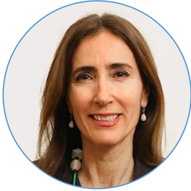
Minister Carolina Schmidt COP25 President

Minister Schmidt holds a business administration degree from Pontificia Universidad Católica de Chile.