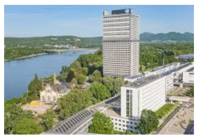
View of UN Campus Bonn