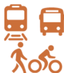
Public transport, walking and cycling actions