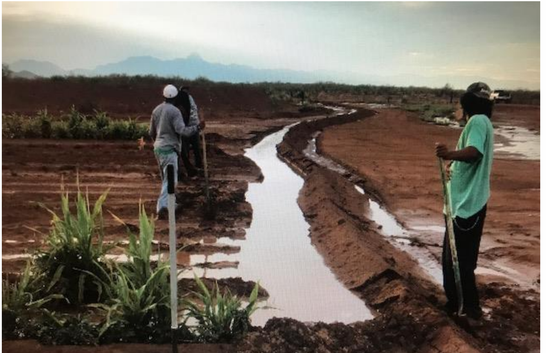
Alexander Pancho Memorial Farm, Cowlic Community, Tohono O'odham Nation, Sonoa Desert, Arizona