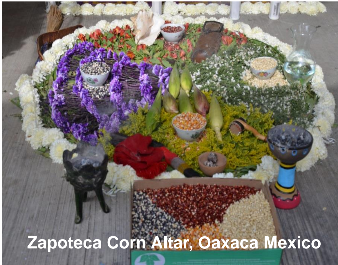
Zapoteca Corn Altar, Oaxaca Mexico