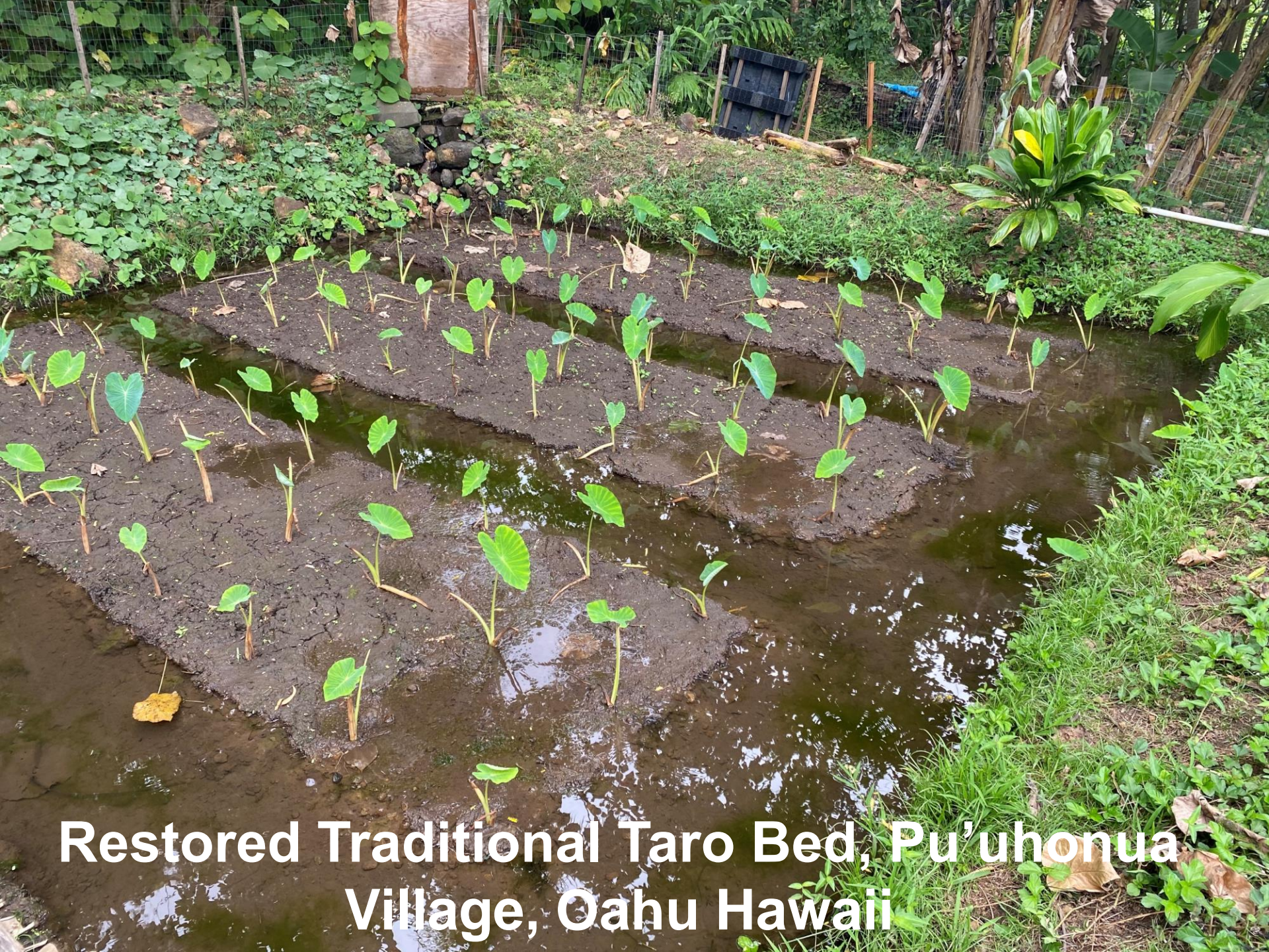
Restored Traditional Taro Bed, Pu'uhonua Village, Oahu Hawaii