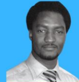
Moustapha Gueye ILO