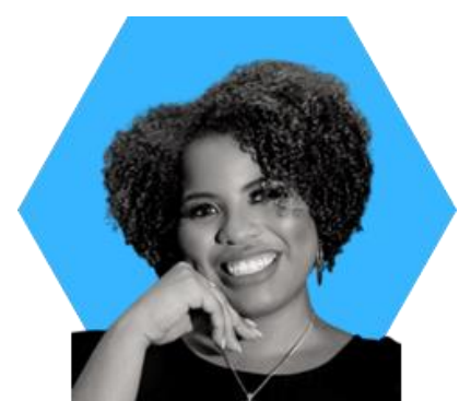
Mabel Zúñiga Ministry of Environment of Panama