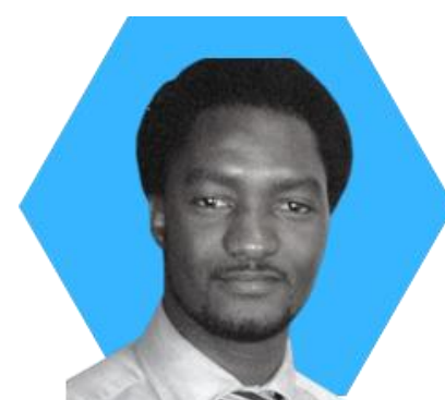
Moustapha Gueye ILO