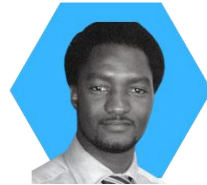
Moustapha Gueye ILO