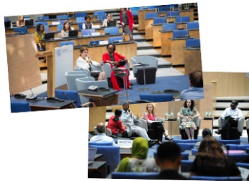
Technical expert meetings