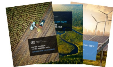
Summaries for Policymakers