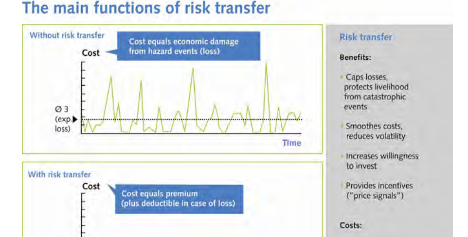
Figure 1 Risk transfer functions, benefits and costs

Expert loss plus markup for production and distribution