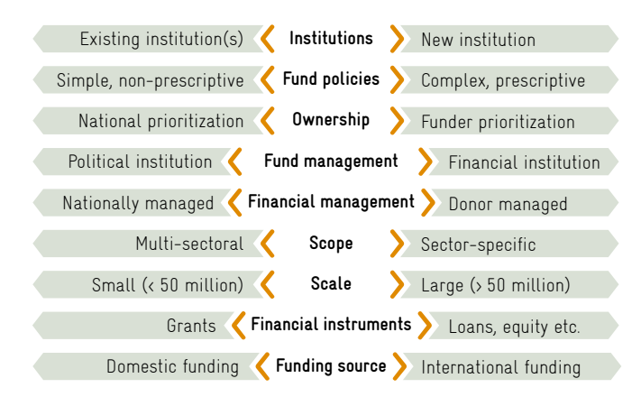
FIGURE 1. Diversity in the funds' design