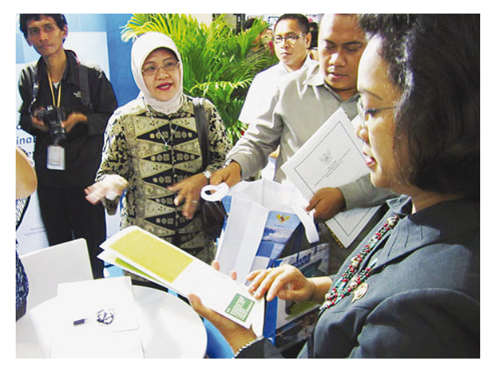
The Indonesian Climate Change Trust Fund was established to fund climate change activities and programs

GIZ supported BNDES in developing guidelines and selection criteria for the Amazon Fund's first thematic call for proposals', providing an improved and more transparent basis for project preparation by proponents, selection and subsequent monitoring.