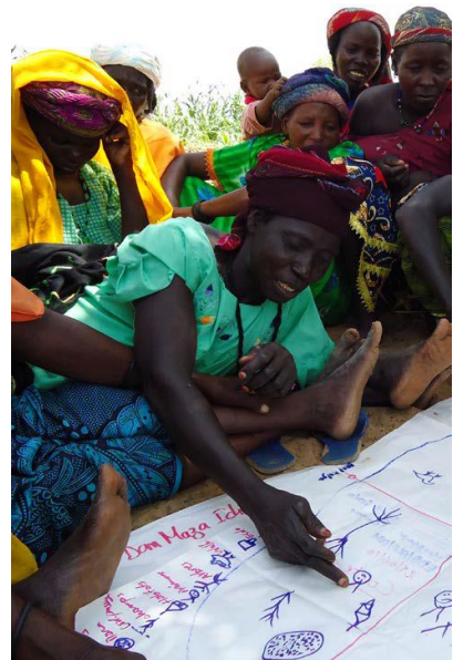
Women from Dan Maza Idi village discuss climate change impacts and plan adaptation

The CARE's Adaptation Learning Programme (ALP) which has been working with 40 communities in Ghana, Kenya, Mozambique and Niger since 2010 to build the capacity of vulnerable households to adapt to climate change, has held PSP workshops twice a year in Kenya, and annually in Ghana and Niger. The workshops have created a space for dialogue between women and men in a community, between communities and local government, and with meteorological staff. As women are engaged in climate risk analysis, their priorities and adaptation issues are shared in their communities and at higher levels, ensuring that adaptation interventions enhance women's adaptive capacity.