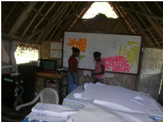
Young girls' group