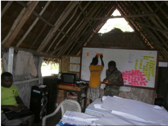
Young boys' group