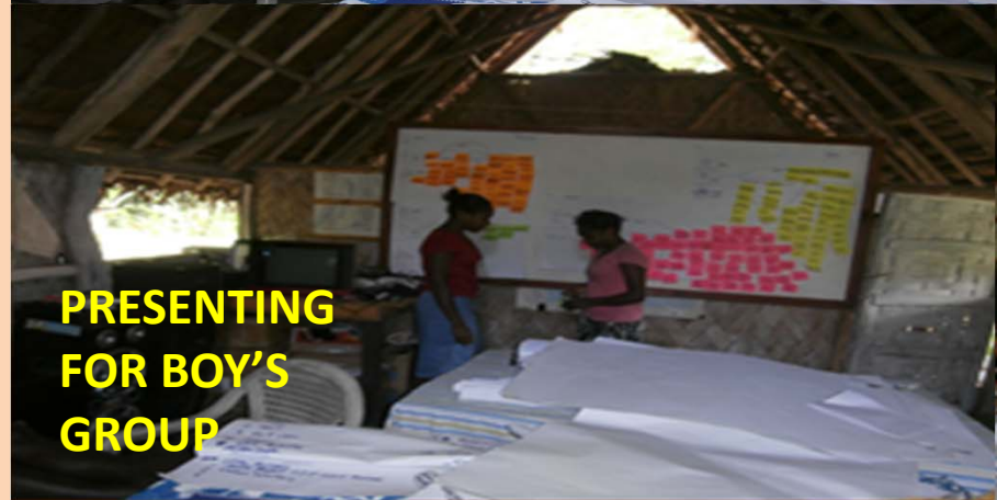
PRESENTING FOR BOY'S GROUP