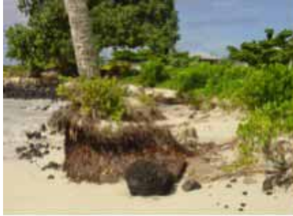
Figure 3 Coastal erosion, Saoluafata village, Upolu Island