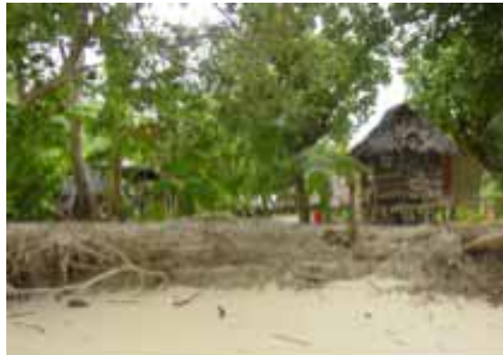
Figure 4 Coastal erosion at Lano village, Savaii Island

Village communities are dependent on the environment and natural resources for their survival and livelihood. For instance, coastal springs and rivers are heavily depended upon for water supply and sanitation. The adverse impacts of climate change on these resources hold vast potential for changes in social, cultural and economic circumstances.