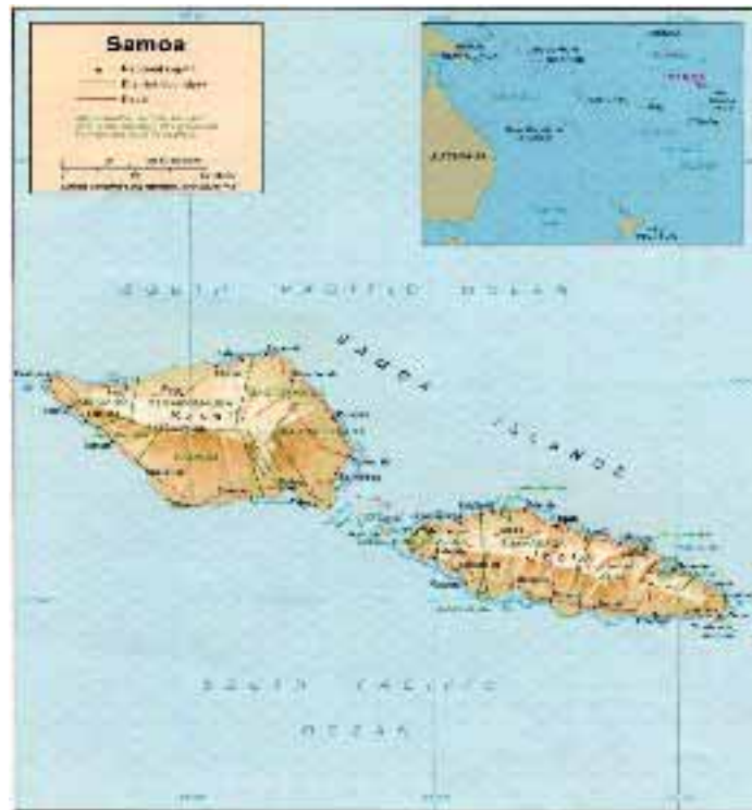
Figure 1 Samoa Islands (insert: Location Map).

Samoa, a small island country in the South West Pacific was the first in the region to become independent in 1962. The 2001 Population Census showed a total population of 174,140 with an economy based on tourism and exports including agriculture, fisheries and forestry products.