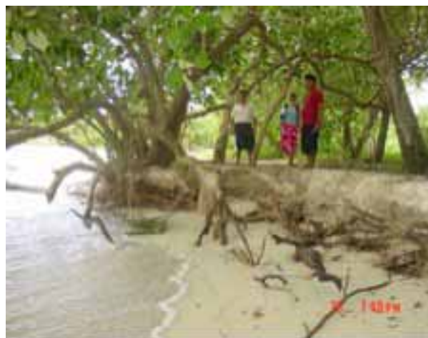
Figure 5: Coastal erosion at Lano Village, Savaii Island

The occurrences of tropical cyclones, long period of droughts and flooding events have affected the source of income of most of the Samoan population. People are losing land to exacerbated erosion from destructive wave activities, frequent storm surges and landslips, causing social problems among families and communities. Some people are facing hardship due to destruction of their plantations by flooding, cyclones, pests and diseases, all of which threaten food security.