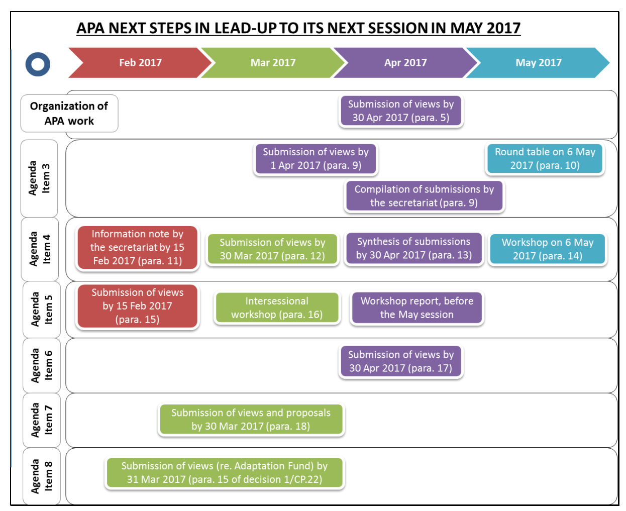
Figure 1. Follow-up work after the Marrakech session of the APA.