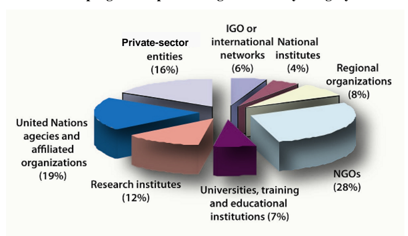
Figure 1 Nairobi work programme partner organizations by category

NGO = Non-governmental organization, IGO = Inter-governmental organization