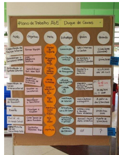
Work plan for Duque de Caxias