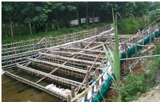
Living weir structure, Tha Di sub-river basin, Nakhon Si Thammarat, Thailand