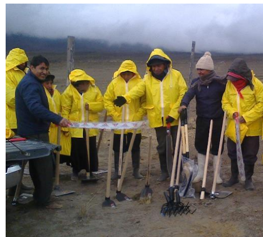
Local parish government of Pilahuín and community members set to work in their forest management association with newly acquired tools.