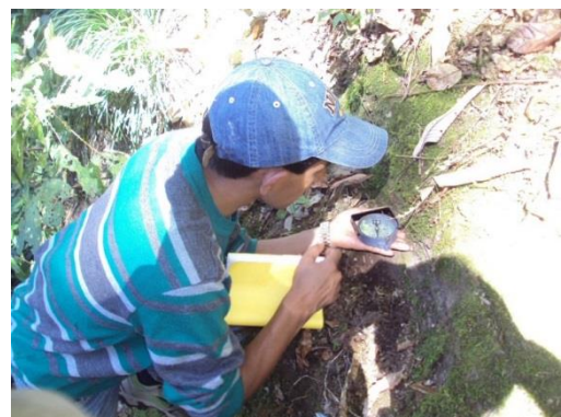
Hydrological mapping

On the basis of the results of the hydrological assessments, the national flagship programme MGNREGA (Mahatma Gandhi National rural employment guarantee act) now implements targeted springshed development in the recharge area of 72 hectares, thus ensuring optimal usage of funds available to the programme. Soil and water conservation measures at the right points have led to an improvement in spring water recharge. Local government officials have received training on scientific methods and technical skills for hydrogeological surveying and monitoring of key springs in the area. 23 springs of the area are regularly monitored in order to quantify the results of the targeted interventions.