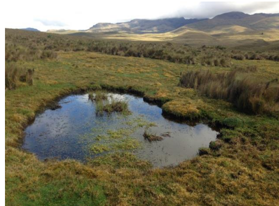
Páramo ecosystem in the province of Tungurahua depicting its hydrological richness and scenic beauty

The páramo – the typical moorland of the high Andes – is an important ecosystem in the area as it provides key ecosystem services, especially with respect to water regulation. Nevertheless, this ecosystem is under severe threats mainly due to overuse and climate change. Thus, its conservation and sustainable use are important elements of the participatory governance model being implemented in Tungurahua. With a projected reduction in annual precipitation in Tungurahua, it is ever more important to conserve the páramo ecosystem in order to ensure long-term water availability.