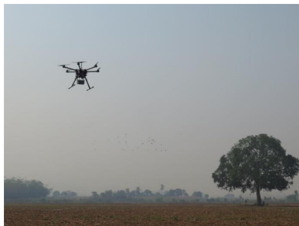
Integration of Drone into the water sector, Lum Pa Chi sub-river basin, Ratchaburi, Thailand

The monitoring concept contains traditional approaches such as hydrologic and morphological data to evaluate the effectiveness of the measures. In addition, an UAV approach contributes to demonstrating the effects of the measures. Periodically, a local university will generate data with the help of a drone.