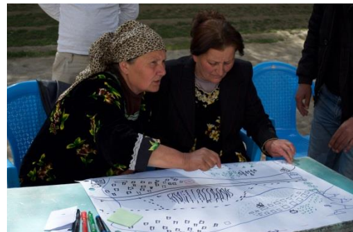
Participatory planning process

EbA should be considered as part of an overall adaptation strategy and works best when combined with other adaptation measures, which are valid for implementation since they also went through the whole selection process and are ecosystem friendly,.