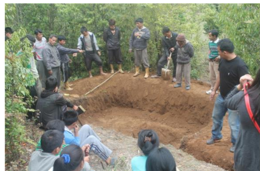
Percolation pit

The project, through partnerships with several institutions and technical experts, brings an innovative scientific approach to the identification and resolution of water management issues. It also links these new methodologies with government schemes such as MGNREGA and the National Rural Drinking Water Program for kicking off a structured implementation of water sector reforms. These endeavours have opened up people's perceptions of power over their local natural resources. It has mobilized communities to address their local governments, seeking resources to carry out interventions on their own.