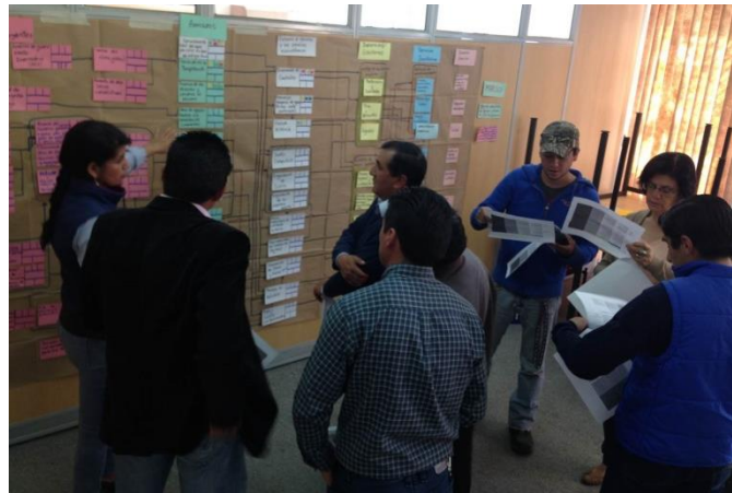
Local stakeholders in Tungurahua conducting a participatory risk and vulnerability assessment using the MARISCO method