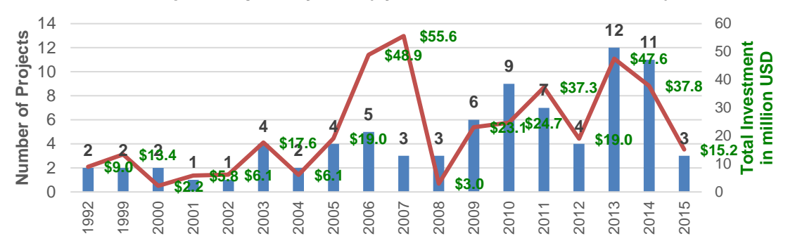
Figure 1: GEF Transport Projects by Year