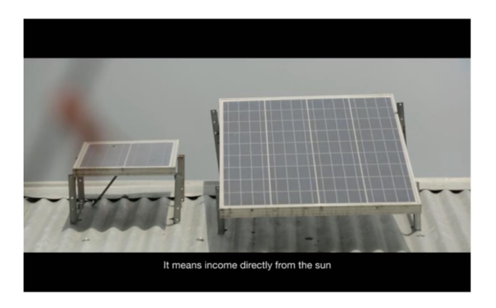
Click image to watch video

Like SOLshare in Bangladesh, which has developed an ICT solution enabling a peer-to-peer electricity trading network for rural households in the country, providing a neat answer to the question of what to do with the excess electricity produced through renewable sources of energy.