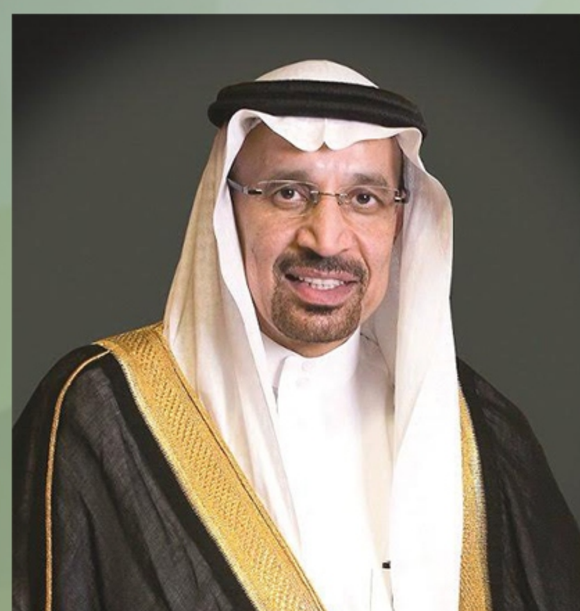
H.E. Khalid Al Falih