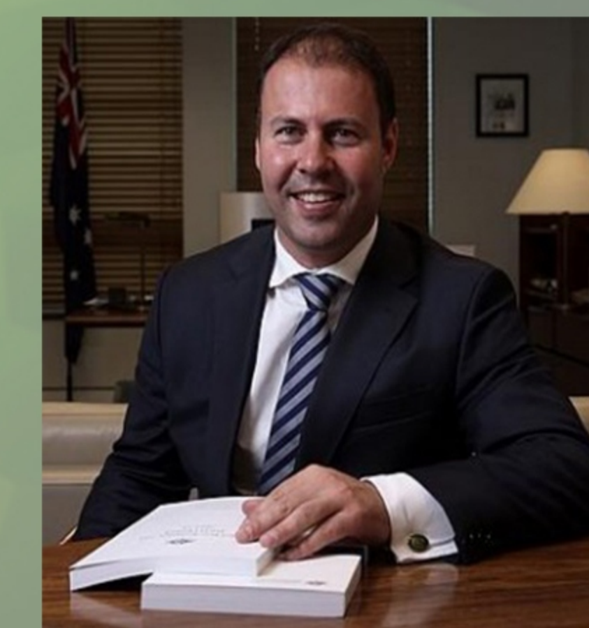
The Honorable Josh Frydenberg