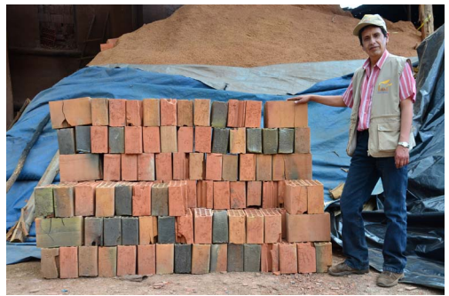
Brick Producers in Perú

In collaboration with the World Economic Forum, the United Nations Climate Change secretariat will launch Momentum for Change: Innovative Finance on 6 December 2012. This pillar will showcase innovative and proven financing examples to support adaptation and mitigation activities in developing countries.