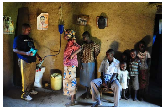
Carbon for Water, Kenya