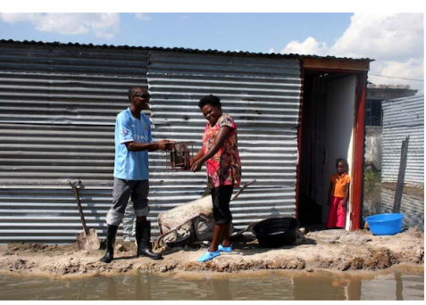
EzyStove recipient in Namibia