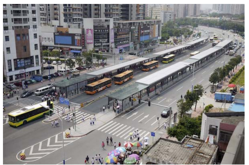
Guangzhou BRT in China

http://unfccc.int/secretariat/momentum_for_change/items/7159.php